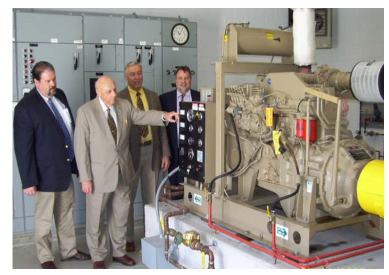
Commissioners and Supt. Dahlem inspect the emergency generator at a District pump station

It's probably not a surprise, but electrical costs are one of our highest expenses. Our annual energy bill is over $150,000 per year. However, last summer the District joined a cooperative effort with 12 other water suppliers on Long Island to participate in an energy demand reduction program. Under this program, the Water District would receive a cash rebate if we were able to reduce our electrical usage during peak demand days, when LIPA is having difficulty meeting the energy demands on Long Island. Because the Water District maintains emergency generators at several of our plant sites, we are able to disconnect from the LIPA system and generate our own electricity. The District received a total of $12,000 in revenue for participating in this program in 2006. In addition, by participating in the program, LIPA and