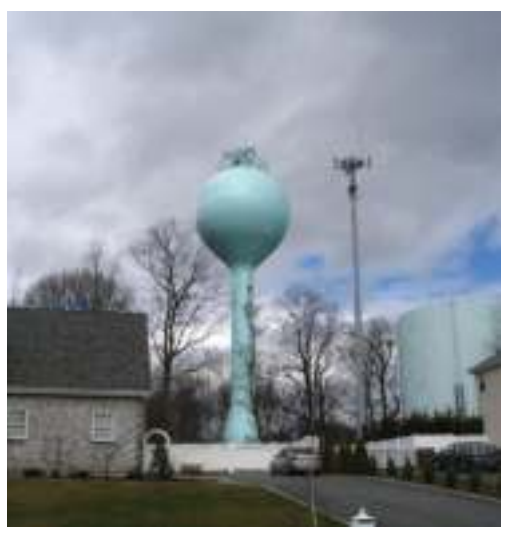
Elevated and Ground Storage Tanks at Schoolhouse Place

The District is also in the design phase of an important modernization project. The project includes the construction of a new computerized control system that will operate all of the District's water supply wells and treatment systems. This SCADA (Supervisory Control and Data Acquisition System) will improve the efficiency and effectiveness of the overall control and operations of the District's remote plant sites. This project will be bid this spring, with construction expected to be completed by the end of the year.