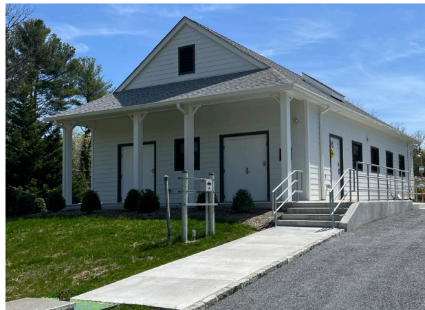
New Treatment Building at Plant No. 2

The Oyster Bay Water District is dedicated to maintaining and enhancing their infrastructure to improve water quality and to provide reliable water service to our community.