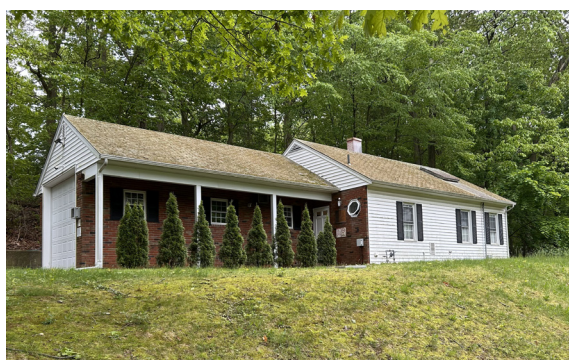
Plant No. 6 - Berry Hill Road

The Oyster Bay Water District has been awarded a NYS Infrastructure Grant in the amount of $3,475, 200 to help fund the construction of a new granular activated carbon (GAC) treatment system at Plant No. 6 on Berry Hill Road. The grant is a result of the District's proactive monitoring and planning for perfluorinated compounds (PFAS). The proposed GAC treatment system will remove the low levels of PFAS compounds found at Plant No. 6. The District anticipates beginning construction by Early 2026.